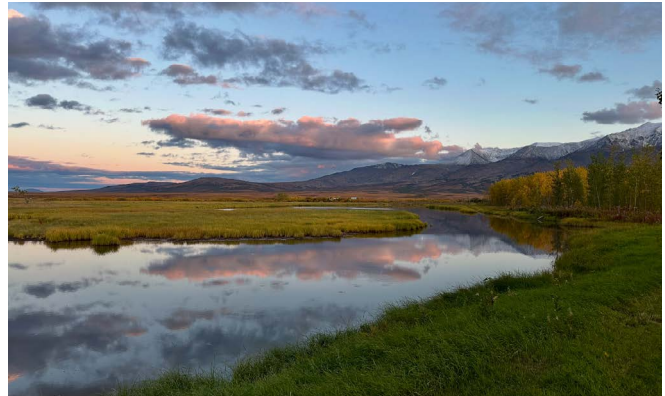
Bathing pools at Pilgrim Hot Springs are naturally heated by geothermal energy.