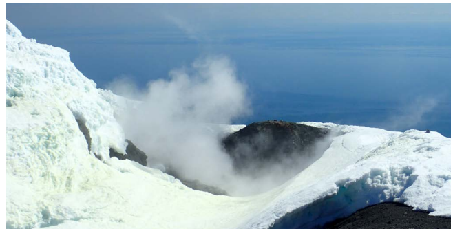
An opening near the summit of Mount Augustine releases steam.

“Mt. Augustine, if not certainly the best place in the United States, is one of the best places in the world to advance geothermal technology ... Geophysical evidence at Mt. Augustine gives an indication that you could get super hot at a shallow depth of only four kilometers.”