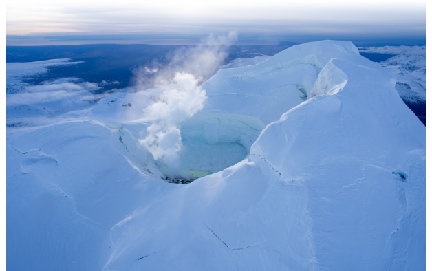
Steam rising from a fumarole at the summit of Spurr Volcano, located 75 miles west of Anchorage.