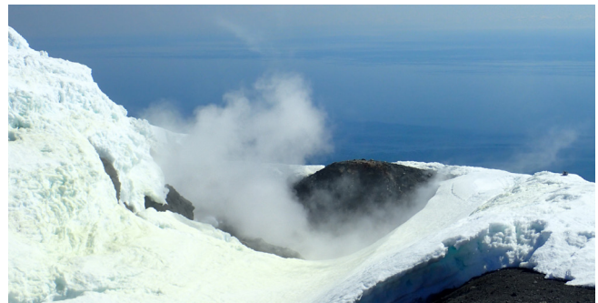
An opening near the summit of Mount Augustine releases steam.

“Mt. Augustine, if not certainly the best place in the United States, is one of the best places in the world to advance geothermal technology ... Geophysical evidence at Mt. Augustine gives an indication that you could get super hot at a shallow depth of only four kilometers.”