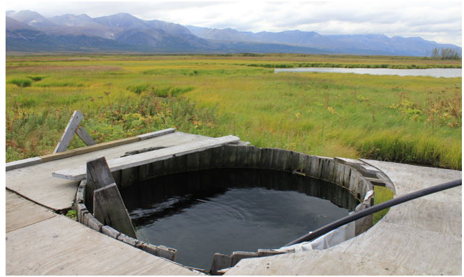
Bathing pools at Pilgrim Hot Springs are naturally heated by geothermal energy.